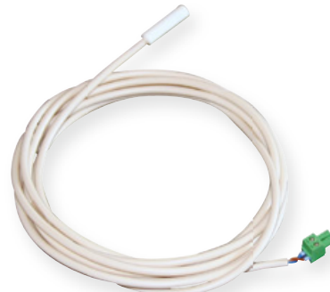
Steca PA TS-S