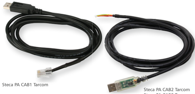
Steca PA CAB1 Tarcom