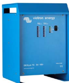
Skylla TG 24 100