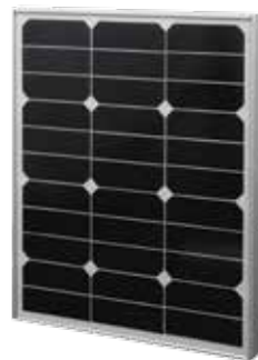
Sun Peak SPR 30