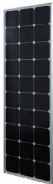
Sun Peak SPR 85S