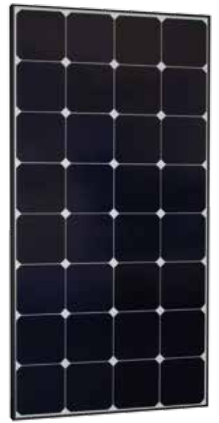
Sun Peak SPR 100